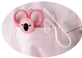
Elastic strap provided

"Chokkin" are designed with gentle, curved lines.