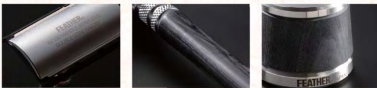
Resin-Impregnated Wood Laminate

Accordingly, long usage results in a distinct texture for a truly unique razor found nowhere else in the world.